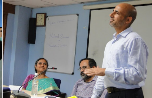
Valedictory function of the Seminar