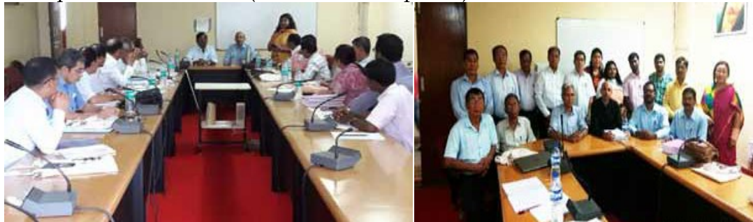
Combined workshop for Manipuri and Santali