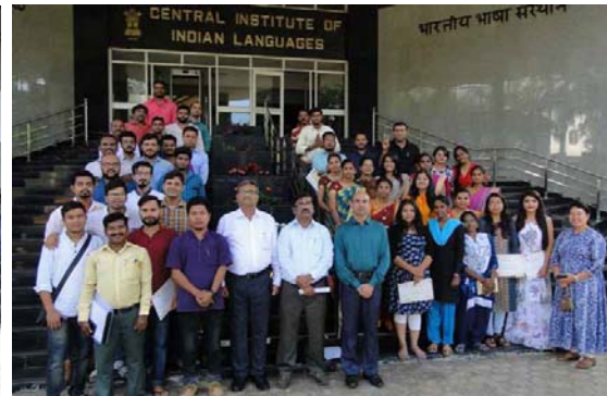
CIIL officials, participants and NTM staff (29 th Batch) | CIIL officials, participants and NTM staff (30 th Batch)

NTM assigned books and research articles to the trainees as part of the practical assignments. Trainees from different language groups took up assignments individually or collaboratively. A few of these materials are expected to be ready by the end of the financial year for publication. Some of the trainees took up reviewing books related to Translation Studies. Some of the participants have jointly given research proposals too. Some trainees have expressed interest to take