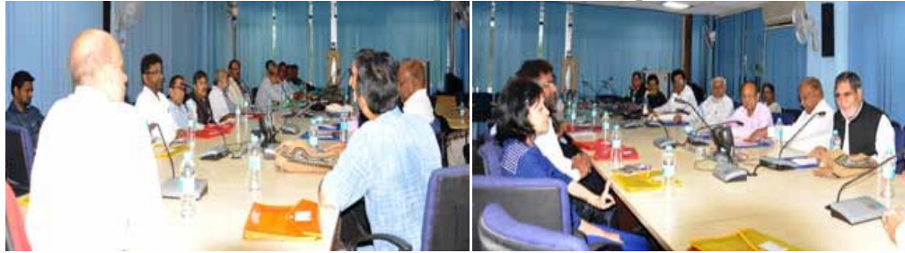
Experts and NTM officials interacting in the Urdu glossary workshops