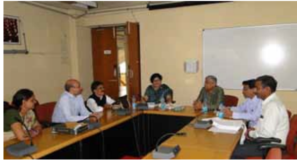
Maithili workshop for translation equivalents