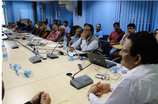
Director, CIIL addressing the gathering.

a seminar website created for the website, NTM website and international research organs like linguistlist.org and conferencealerts.com . Apart from a keynote address, a plenary lecture, over 15 papers were presented in the seminar. NTM plans to publish a collective volume from the papers presented in the conference. The seminar website received over 1300 hits.