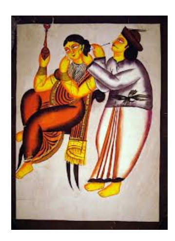
( Hutom Pyanchar Naksha embellished with images: from Google browse on 'patachitra' https://www.google.co.in/search?q=patachitra+of+kalighat)

Juxtaposing the text with intermedial supplements emphasizes the reader's role in its critical reception. This is an example of what Bourdieu called the "reflexive" sociology of literature that makes the discipline its own object of study and invites interaction between scholars and the existing social conditions.