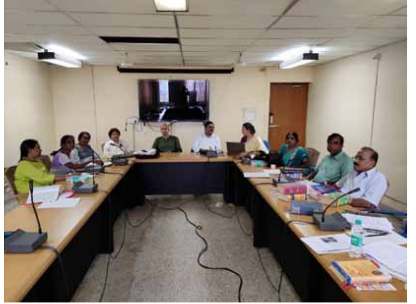
Experts with NTM authority & Kannada staff of NTM during the Inaugural function of the workshop

During the workshop the translation was reviewed by both the discipline and language experts. Discipline experts could complete the finalization of ten chapters from the subject point of view, whereas out of the ten finalized chapters only four chapters were finalized by the language experts from the language usage and presentation points of view. Since the book is technical in nature, the team opined that two more workshops would be required to complete the editing and finalization of the script.